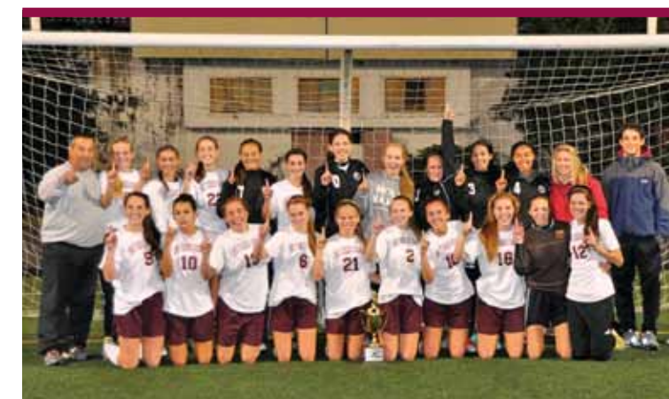
HNA Varsity Soccer Team – 2012 Metro League Champs and 3rd at State

History Bowl team competed for the first time in the Regional tournament against teams from across Western Washington. HNA finished with a collective record of 4-6, just barely missing the Final Four round. Based on total points earned and overall record, the team qualified to compete in the State tournament in February.