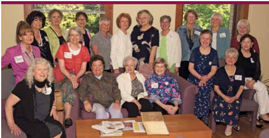
55th Year: Class of 1957: The Class of 1957 gathered at the Reunion Mass, then held a potluck reunion in the HNA Faculty Lounge.