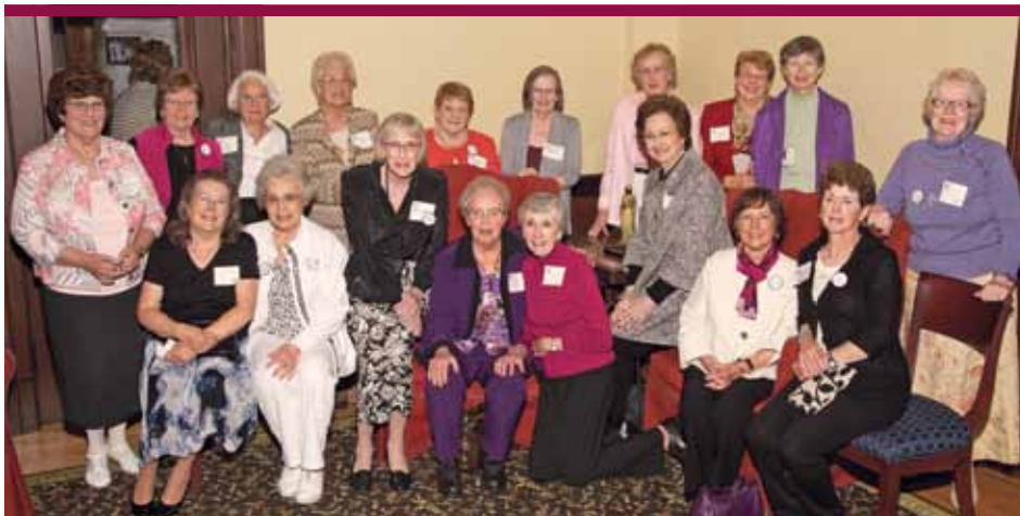
60th Year: Class of 1952: Eighteen members of the Class of 1952 attended the 50th Year/50PLUS Reunion Mass and reception.