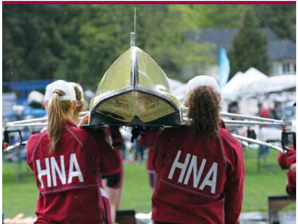
HNA crew members at Brentwood Regatta are "hands on" walking an 8+ to the dock prior to a race.