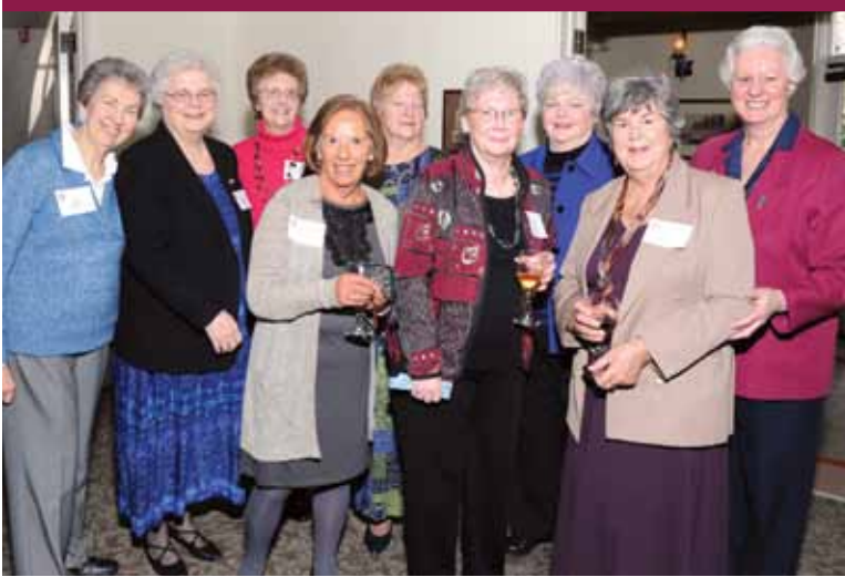
The Class of 1956 , rumored to be the “best class ever,” had the most classmates attend the annual luncheon at the Inglewood Golf Club.