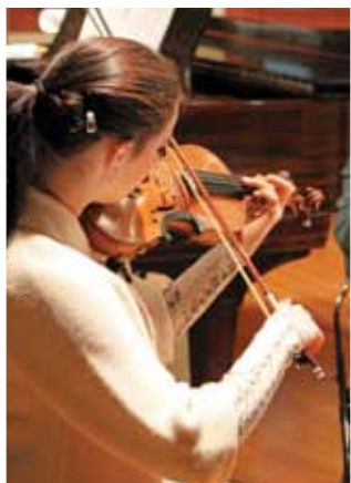
Music students performed throughout the evening.