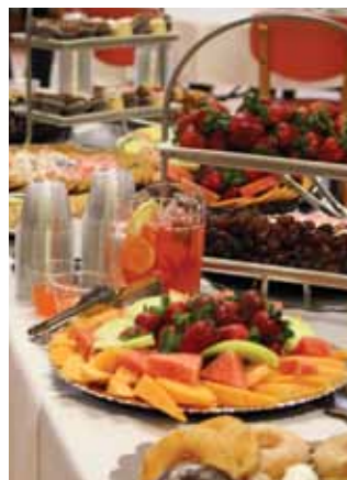
Guests enjoyed a delicious array of refreshments.