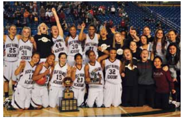
The undefeated 3A State champions celebrate in the Tacoma Dome.

It is a school tradition for the student body to line the halls and clap out