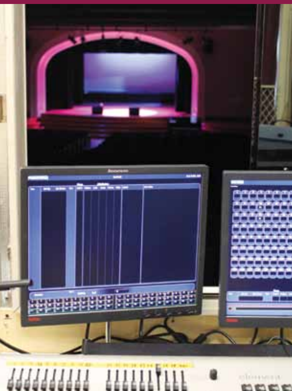
← ..... The view of the lighted auditorium stage from the newly equipped control booth.

Just as every classroom under the Dome now features a computer-based