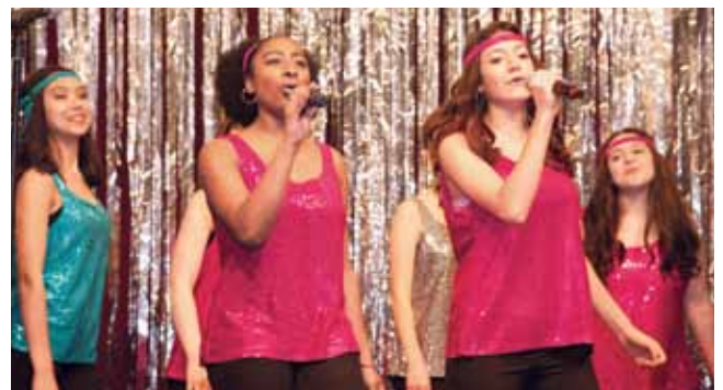
HNA’s Vocal Ensemble performed rocking Disco Fever songs of the 70s.