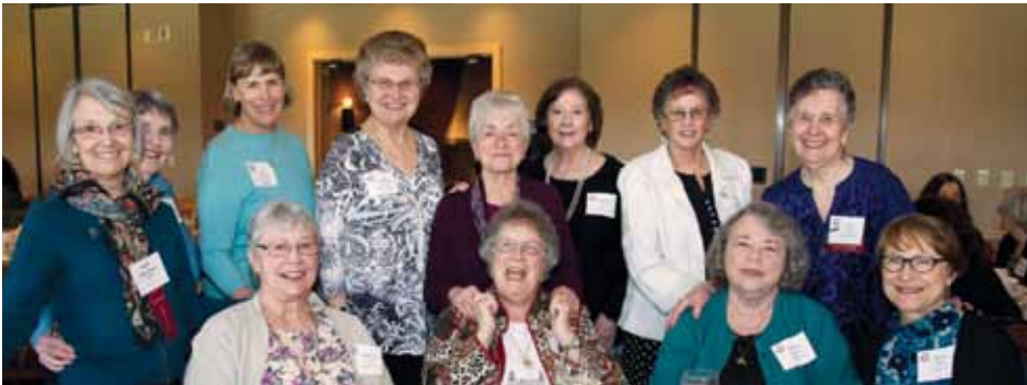
Above: With 15 reservations, the Class of 1957 had the most in attendance; each alumna received an HNA lidded beverage tumbler in recognition of their strong turnout. Below: The Class of 1974, just one shy of a tie, had 14 classmates register for the annual luncheon.