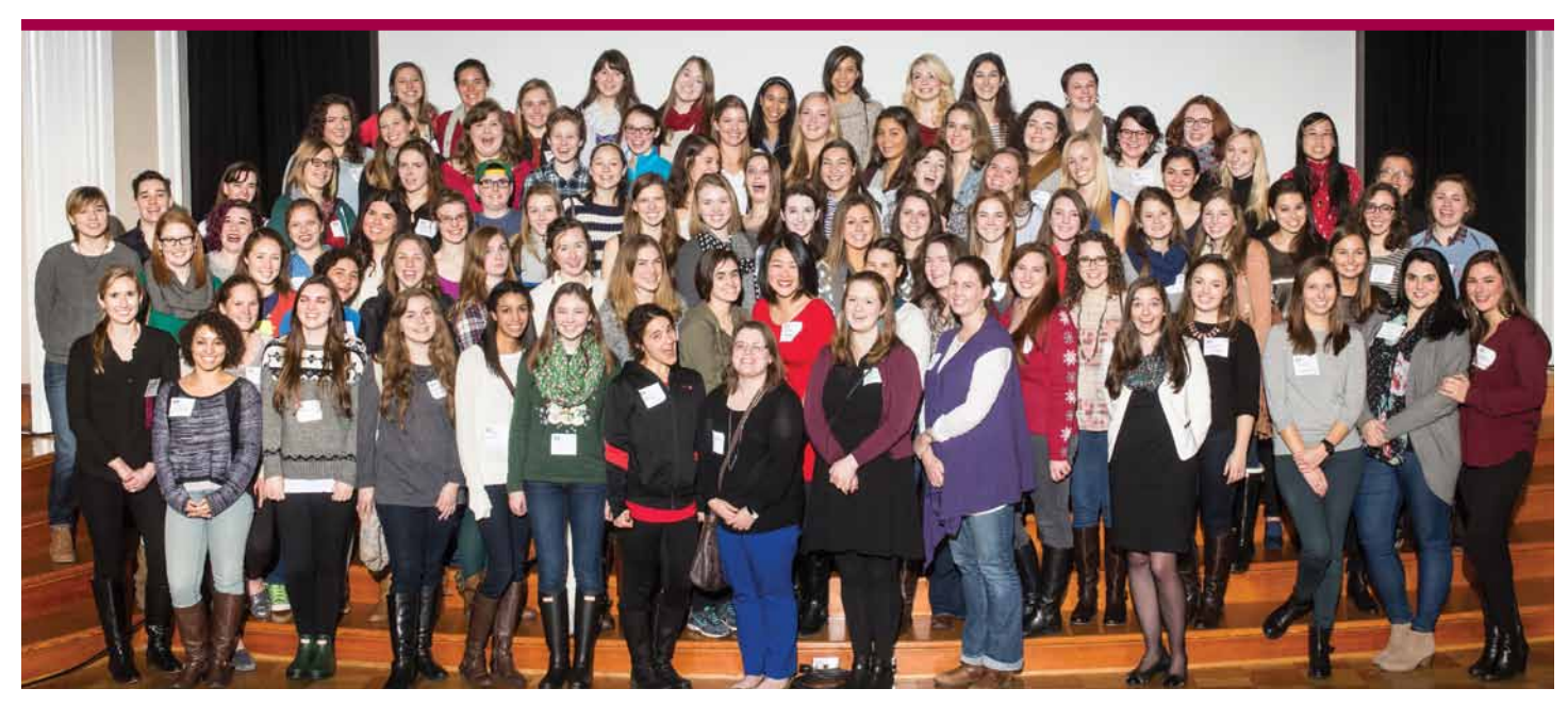
Alumnae from the Classes of 2006 through 2014 gathered in the HNA auditorium for a group photo, gift-card raffle drawing, and presentation of the Young Alumnae Community Service Awards.