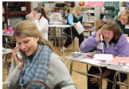
Thank you to all the volunteer callers who gave their time and talent to raise money for HNA.

Thanks to the dedication of our volunteer callers and the generosity of the HNA community, last year's Fall and Spring Phonathons raised over $92,000 to support financial aid, professional development, new technologies, program initiatives, and endowed scholarships funds. We are grateful to the 773 alumnae who gave a gift to support current and future students!