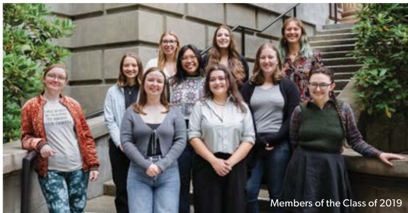
Members of the Class of 2019