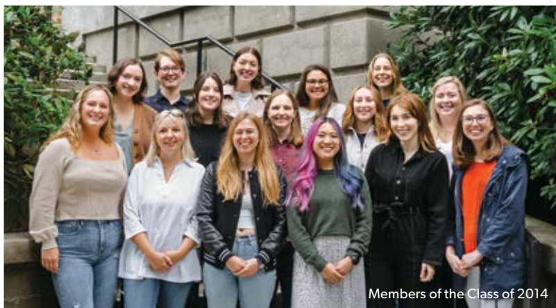
Members of the Class of 2014