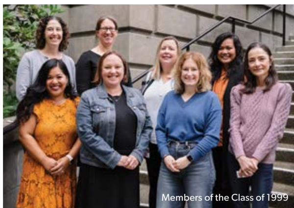
Members of the Class of 1999