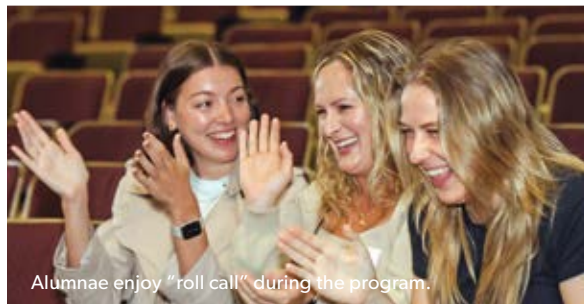
Alumnae enjoy "roll call" during the program.