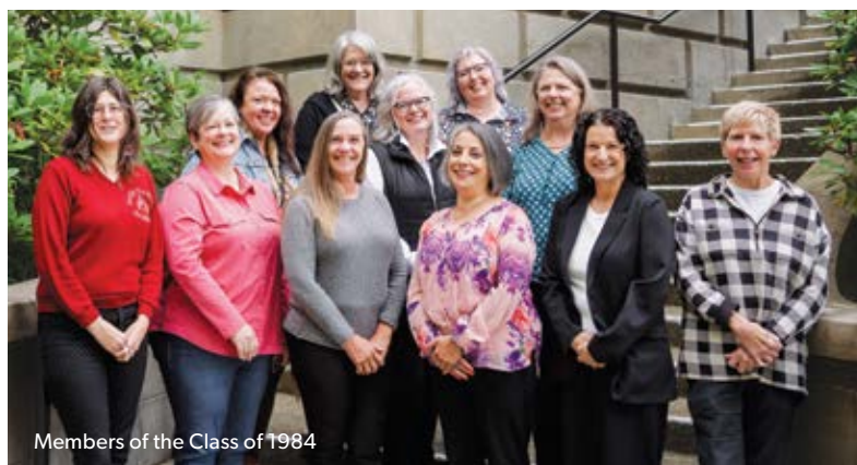
Members of the Class of 1984

In September, the Alumnae Office was thrilled to welcome back alumnae from many decades to celebrate their class reunion. In recent times, the Alumnae Reunion Celebration has been held for classes celebrating a milestone reunion between five and 45 years. This year, the Classes of '79, '84, '89, '94, '99, '04, '09, '14, and '19 gathered for a brief program that included a stunning performance by HNA's Vocal Ensemble, building tours, refreshments, and social time. Thank you to all who came out to celebrate your class and your school!