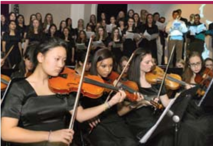
The HNA String Quartet accompanied the Vocal Ensemble and the Father/Daughter Choir.

It takes many hands to make a success of an event like Deck the Dome. To all who participated, thank you! Through the generosity of our community, the auditorium will have more light and the future of HNA will be even brighter.