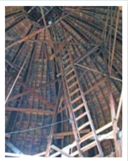
Picture of the dome interior with the ladder to the top.