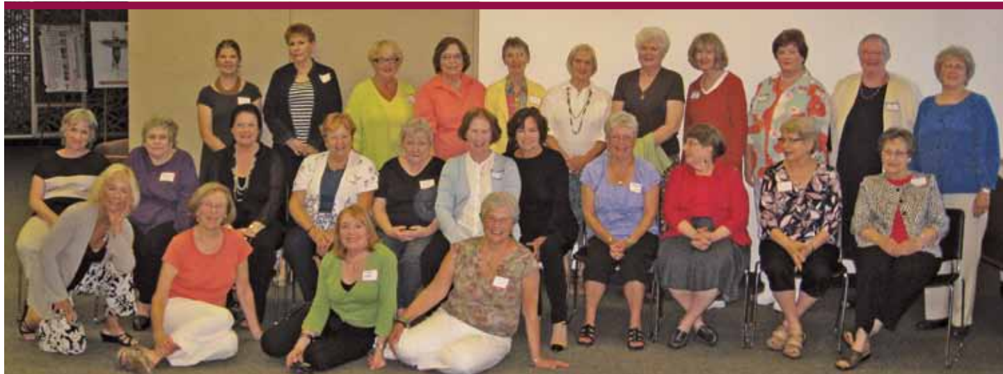
Class of 1958: Twenty-six classmates gathered for a catered dinner and "lots of chatting" at their mini-reunion on July 8, 2011 at the Our Lady of Fatima Parish Center.

Contact the Alumnae Office at (206) 720-7804 or alumnae@holynames-sea.org . Check the HNA website at www.holynames-sea.org , link to Alumnae/Reunions for the details of your class reunion.