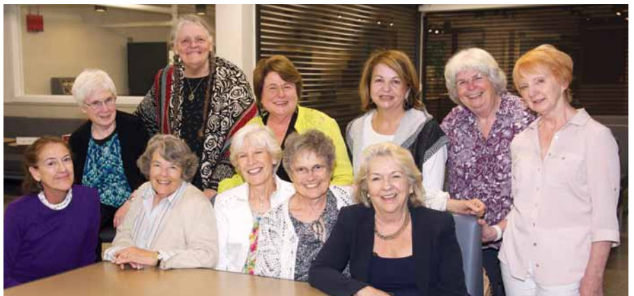
Right: Members of the Class of 1961 celebrated their 55-year reunion with box lunches in the new HNA Café.